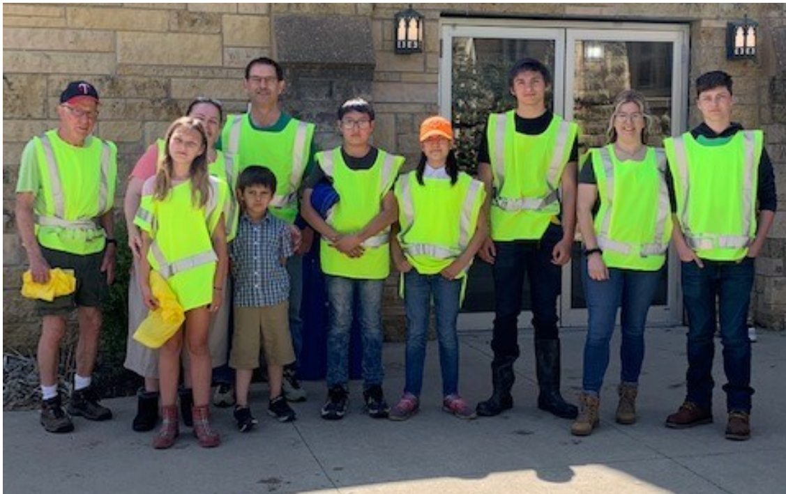
Ditch Cleanup took place on Sunday May 15th .